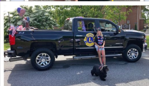
Westminster Memorial Day Parade May 29, 2023